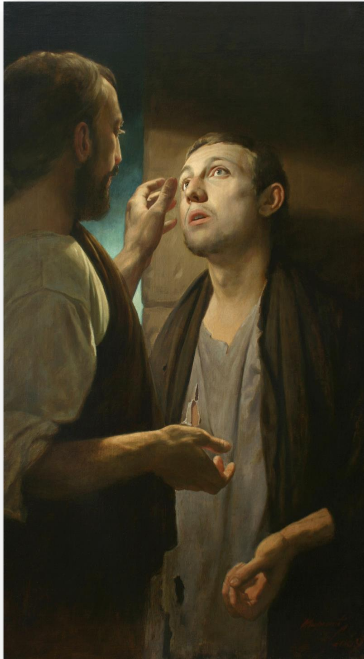
Christ and the Pauper

Sunday – 19 March 2023 – Lectionary Link