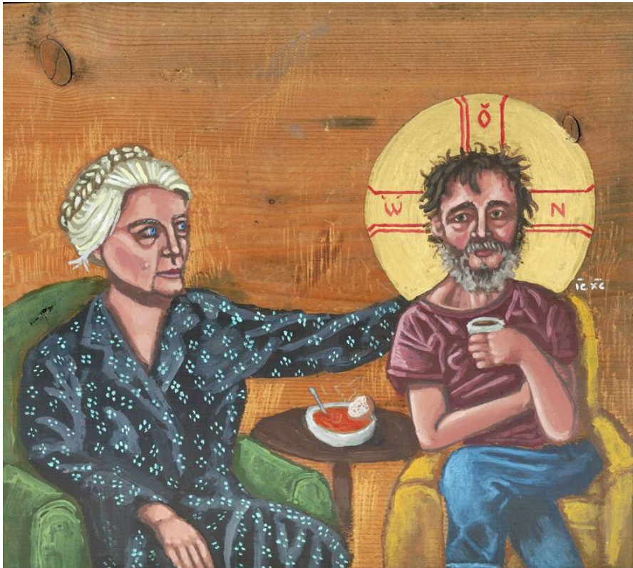
Dorothy Day with Homeless Christ